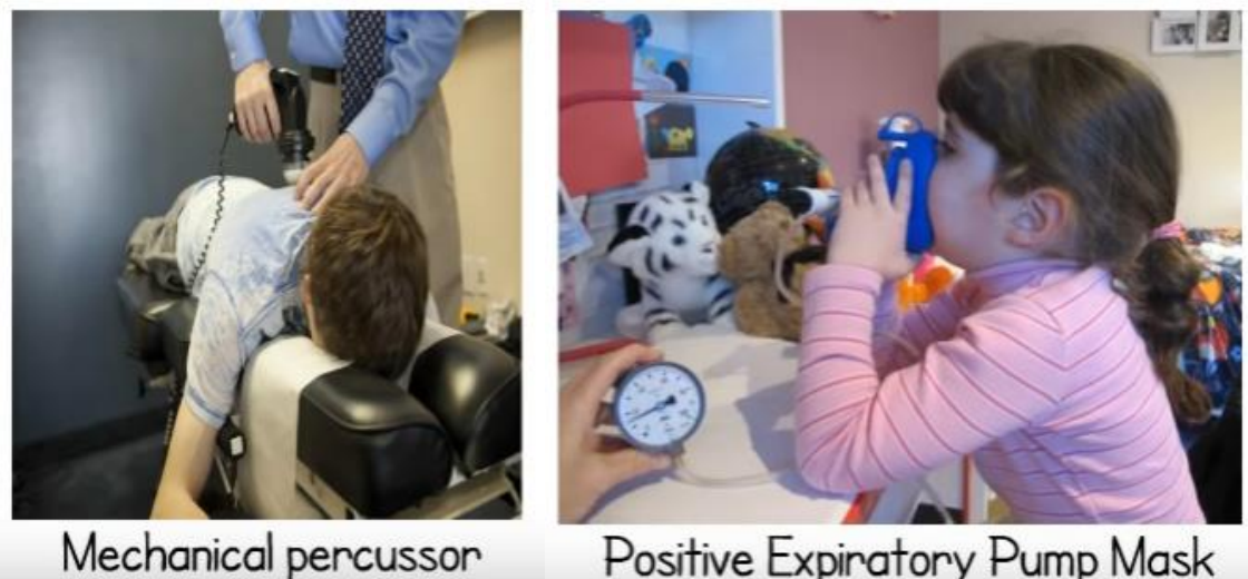
Figure 3 and 4: Device used in chest physical therapy.

A major goal around are nutrition and healthy weight gain. Fortunately, fat soluble vitamins (A, D, E and K) extra calories, and replacement of pancreatic enzymes, can all be supplemented to help boost nutrition and help the patient absorb nutrients.(17) In terms of pulmonary treatment there's chest physiotherapy, which loosens the mucous by literally banging on the chest as well as inhalers. There are some medications like N-acetylcysteine which cleaves disulfide bonds in the mucus glycoprotein and dornase Alfa which is a nucleus that cuts up nucleic acids in the mucus to thin it out. CF lung disease is obstructed (like asthma and COPD) so pulmonary function tests are regularly used to monitor the disease. Finally because of chronic infections and loss of pulmonary function overtime, a lung transplant is sometimes needed. A new hope for patients with CF has been the development of personalized treatments that Target specific CFTR mutation types. For example, lumacaftor is a chaperone that can bring the mutated Delta f508 CFTR to the cell membrane and is given