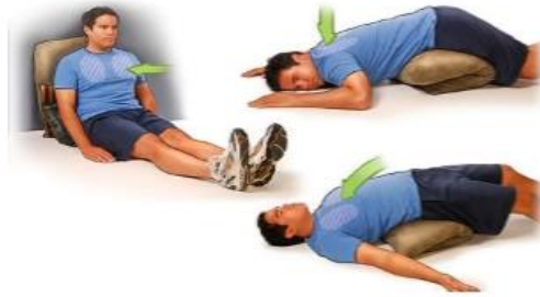
Figure 2: chest physiotherapy.